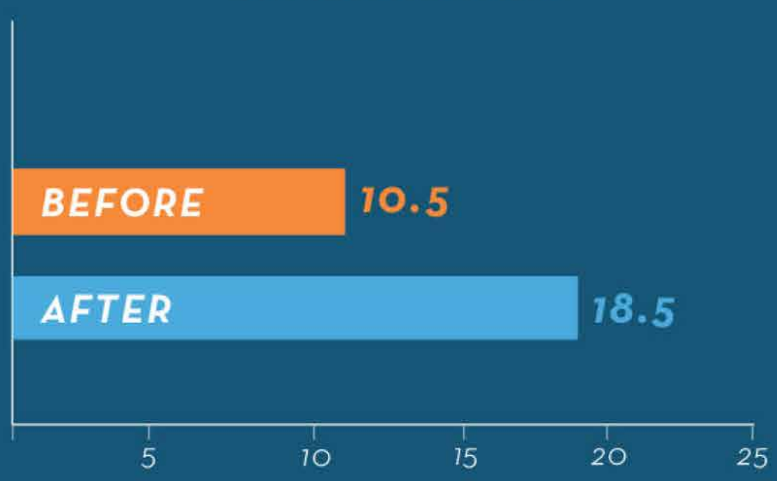
SEN AND PP CHILDREN: AVERAGE SCORES